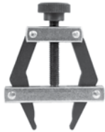
CP25-60 FOR SMALL PITCH CHAIN (#25 THRU #60)