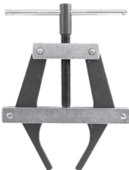
CP100-180 FOR LARGE PITCH CHAIN (#100 THRU #180)