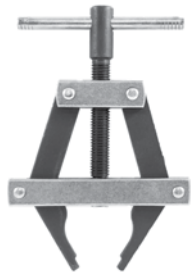
CP60-100 FOR MEDIUM PITCH CHAIN (#60 THRU #100)