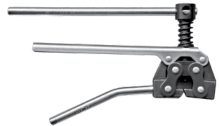
CB60-100 FOR MEDIUM PITCH CHAIN (#60 THRU #100)