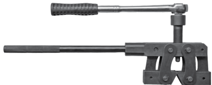
CB100-180 FOR LARGE PITCH CHAIN (#100 THRU #180)

Replacement Tips for Chain Breakers also available.